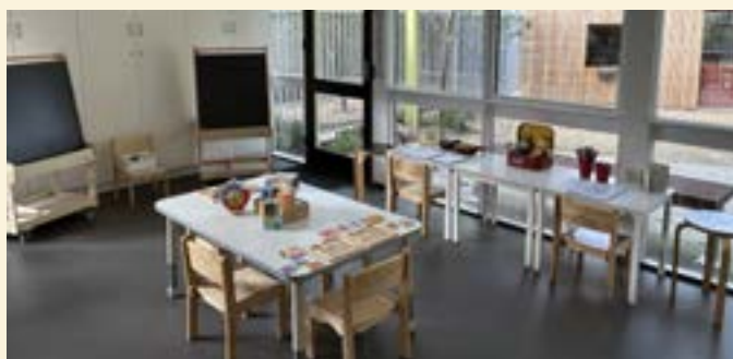
Craig Family Centre, Ashburton